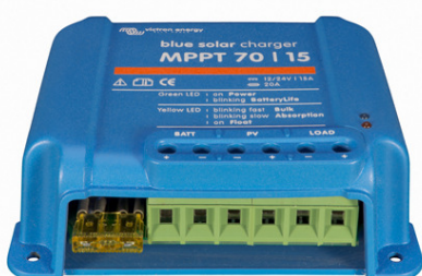
Solar charge controller MPPT 70/15