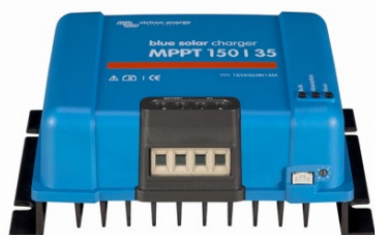
Solar charge controller MPPT 150/35