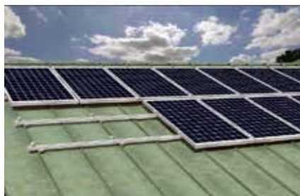
PV modules with aluminium frame