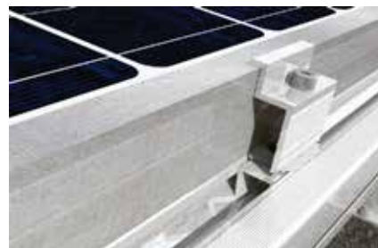
Detail: fastening of PV module