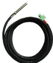
RTS300R47K3.81A Remote temperature sensor (3m)